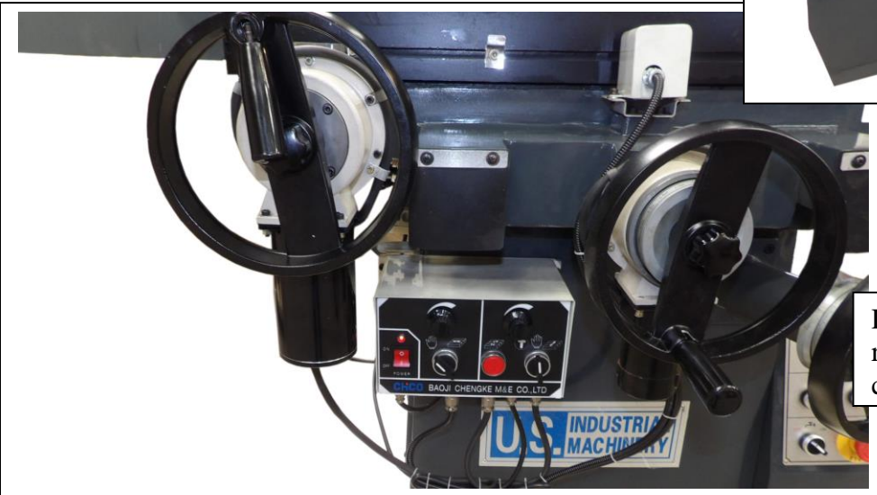
Detail showing electric motor table reciprocation and electric motor table crossfeed control selection.

Thank you for the opportunity to quote. We look forward to serving you.