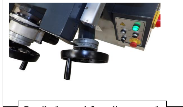
Detail of manual fine adjustment of downfeed with 0.0002" graduations