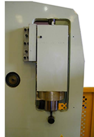
Heavy Duty Cylinders