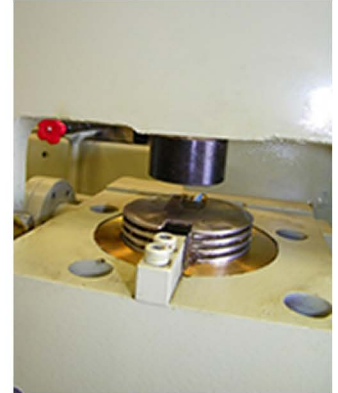
Positive Mechanical Stop