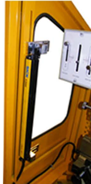
Sick Light Curtain