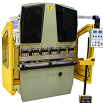
22 Ton x 4' Hydraulic Press Brake