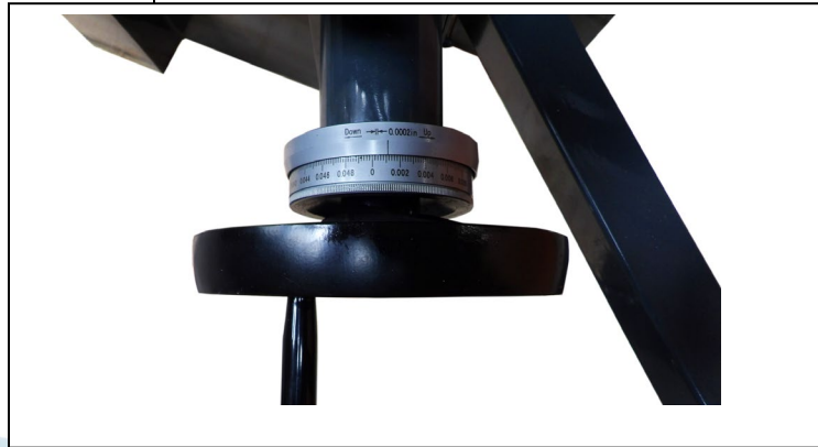
Detail of manual fine adjustment of downfeed with 0.0002" graduations