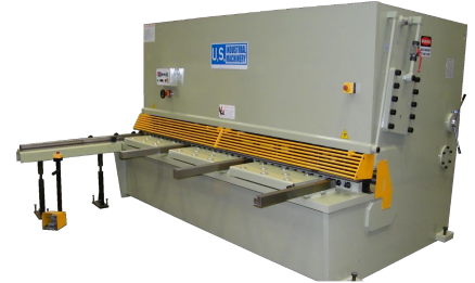
Shown with options