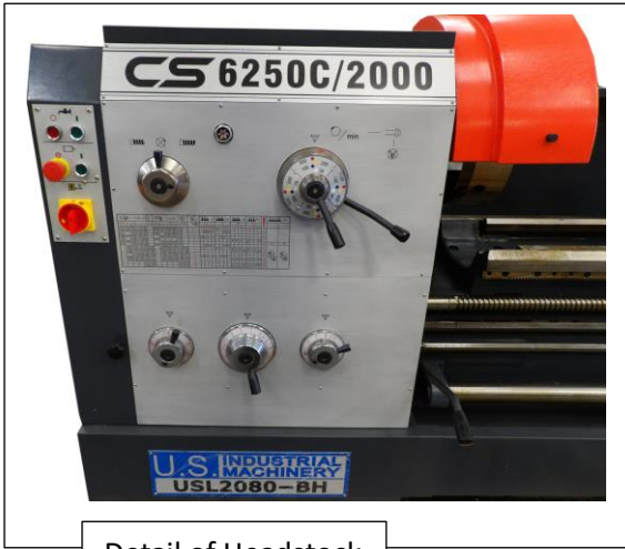
Detail of Headstock

Visit Our Web Site at www.usindustrial.com