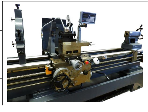
Apron with travelling digital readout display, follow rest, steady rest, taper attachment, rapid travels.