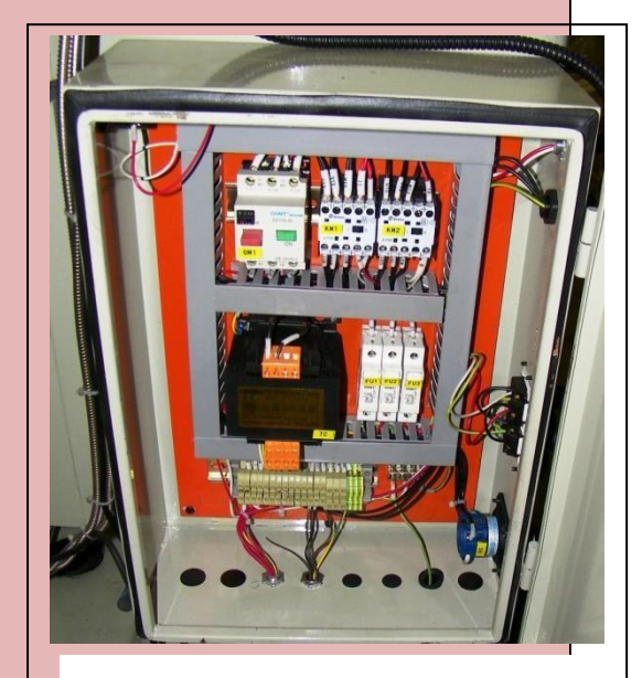
Electrical Cabinet –Control and accessory power transformer, circuit breakers and main disconnect.