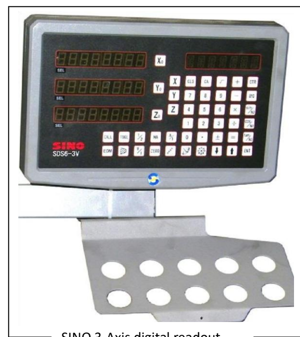
SINO 3-Axis digital readout measure table, cross and knee travel, inch/metric, and multifunctionality